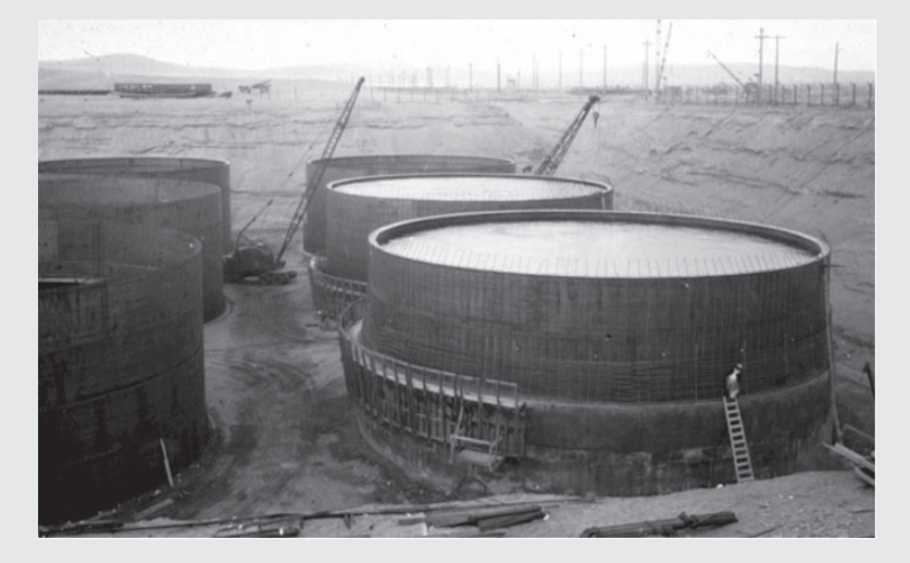
FIGURE 2-1 A new species of radiation-resistant Deinococcus isolated from radioactive sediment beneath a leaking Hanford waste tank (DOE, 2002).

The ionizing radiation-resistant microorganism Deinococcus radiodurans , a strain of which was isolated from a radioactive sediment beneath a leaking waste tank on DOE's Hanford site in Washington state, has remarkable capacity for resisting environmental stresses, such as radiation and desiccation, and can transform contaminants, such as chromate, to less mobile and hazardous forms. Recent research has also revealed that Deinococcus accumulates high concentrations of intracellular manganese while limiting its intake of iron—factors hypothesized to be largely responsible for its ability to resist ionizing radiation. The underlying biological mechanisms responsible for those traits, however, remain unknown. Genomics, the study of the genes and their associated functions, has tremendous potential for revealing the underlying mechanisms and the environmental factors that control their expression (DOE, 2002).